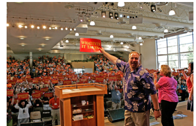
Whatever it takes! A capacity crowd fills Saddleback worship center to hear Pastor Rick Warren encourage each and everyone in attendance to give it everything they've got... "Whatever it takes!" to build the Kingdom of God.

"And now Christians have been fiddling around while the world goes to hell."